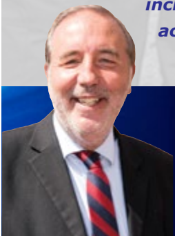
Paddy Tipping Nottinghamshire Police and Crime Commissioner

Your priorities are my priorities. Every year, people tell me they want more police officers in their communities and I am immensely proud to have delivered. Our frontline has grown by 260 officers over the past two years alone and another 100 are on the way. These extra resources have helped put Nottinghamshire in an enviable position – as one of the best-performing forces in the country when it comes to cutting crime. Together with our partners, we are also helping more people to tackle their problems and access the support they need. The list of achievements is endless but maintaining this success is critical and I am always looking at what more I can do. Amidst a pandemic, it is more important than ever that we respond to the needs of vulnerable people and remove any risks that increase the risk of harm across our communities.