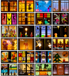
Granby & Sutton Living Advent Calendar 2018

Supported by the Granby cum Sutton Parish Council ( www.granbycumsutton.org )